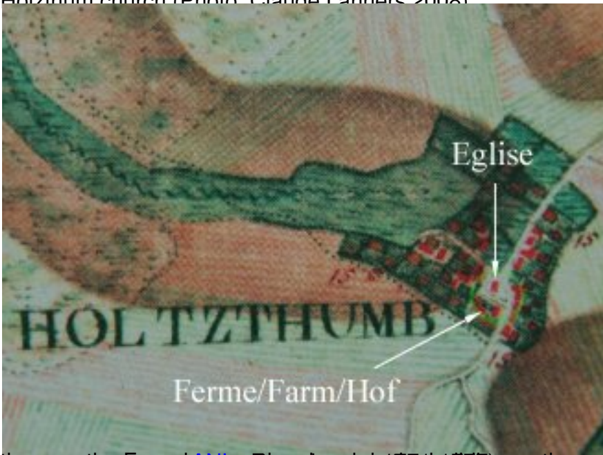
Holzthum on the Ferraris map. The church is the building on the square in the center of the village (, Ferraris map 1771-1777)