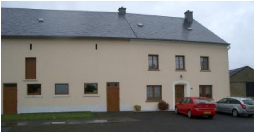
The farm in 2008