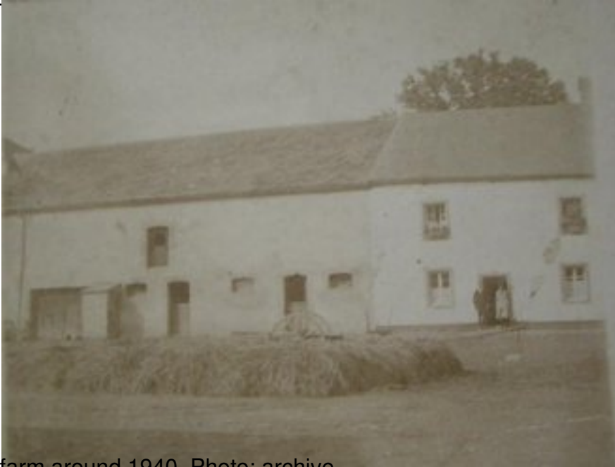
The farm around 1940