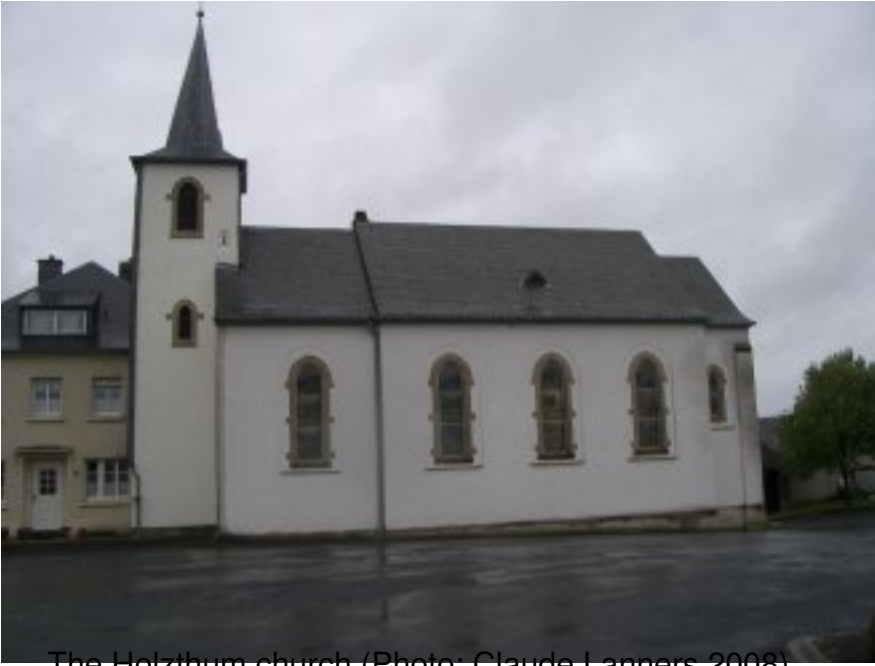
The Holzthum church

Last Updated Monday, 30 April 2012 19:10